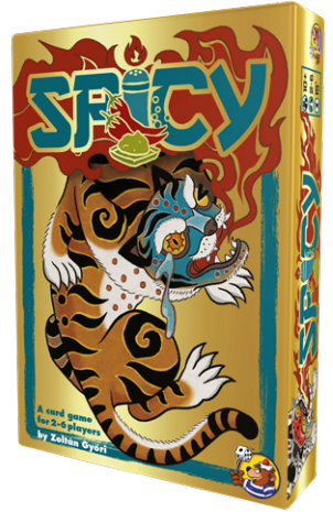
SPICY Box with gold foil Background

We hope to realize this project with a Native American artist. It would make the game feel ... right.