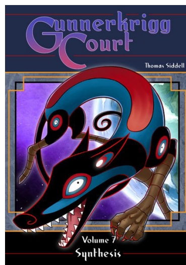
Image: (2019) BOOM! - Archaia Gunnerkrigg Court Vol. 7: Synthesis (English Kindle Version Cover)

Or something very different? As we said, modern is fine for us, too.