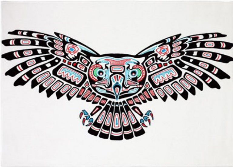
Image: Mystic Owl in Native American Style Art Sticker by Cleave (william cleave drummond) www.redbubble.com

But we also hope for bolder, more modern, or more dynamic ideas.